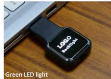
Green LED light