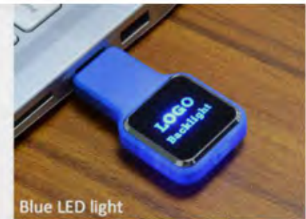
Blue LED light